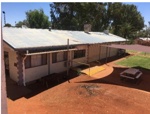
Existing Community Centre