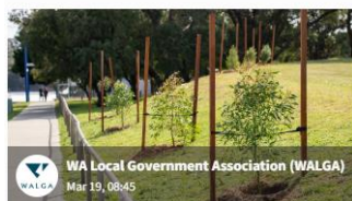
From today, Local Governments throughout the Perth and Peel regions will share in $591,839.32 worth of funding under the first round of the Urban Greening Grants Program. "This is a terrific start to the Urban