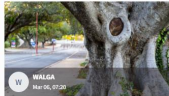
Local Governments taking the lead to protect mature trees on private land WALGA has today released a new Model Local Planning Policy (LPP) to support Local Governments to stem the loss in tree canopy cover in