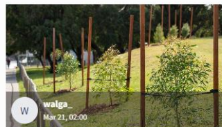
Local Governments throughout the Perth and Peel regions will share in $591,839.32 worth of funding under the first round of the Urban Greening Grants Program. "This is a terrific start to the Urban Greening Grants