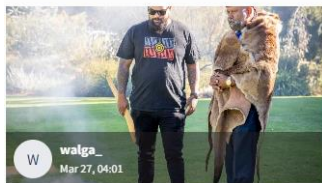
Last week, WALGA hosted our annual Aboriginal Engagement Forum at the State Reception Centre, Kaarta Gar-up (Kings Park). Returning in 2024 with an elevated look and feel, the event commenced with a