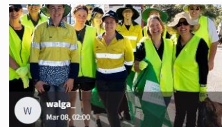
On Tuesday March 5 Team WALGA cleaned up Railway Parade (home of the WALGA office), collecting 31kg of waste and 53 beverage containers! WALGA is part of the Keep Australia Beautiful Council's Adopt a Spot Program