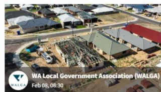
As Western Australia experiences a brutal 3-day heatwave, we are reminded we need Cooler Cities and Shadier Suburbs. We need more tree canopy. In WA we are losing trees and at a rate faster than we can replace