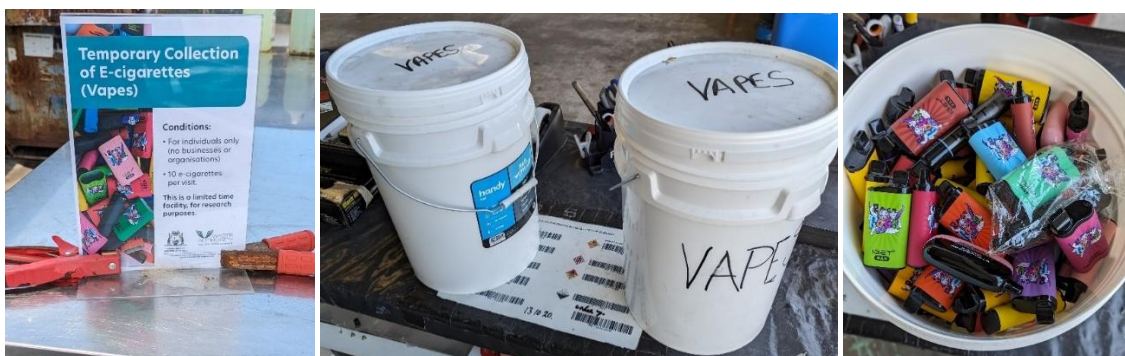
Figure 2: E-cigarette drop off signage and collection buckets.