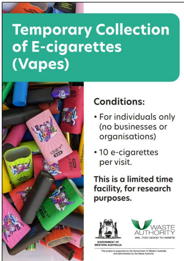
Figure 1: Drop off signage at Recycling Centre Balcatta.