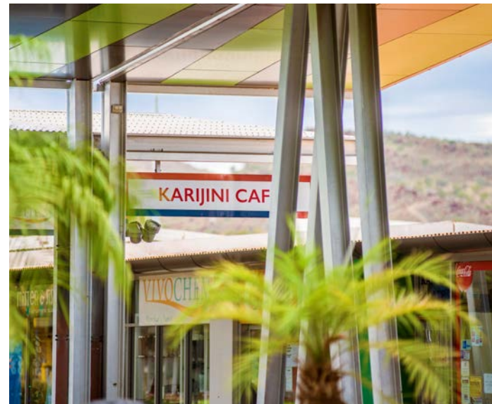
Local businesses struggle to invest and grow

"I am grateful this issue is featuring in Western Councillor . Garnering the support of other Local Governments in WA is crucial as we tackle this national concern."