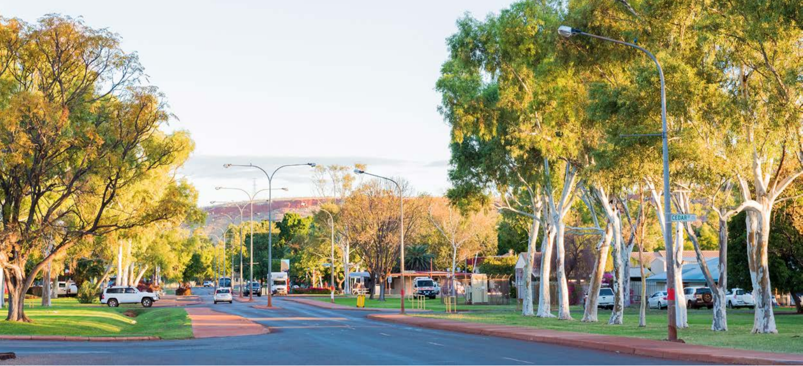
The main street in Tom Price