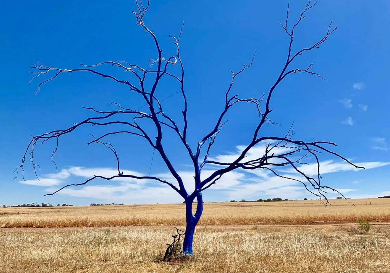
The original Blue Tree