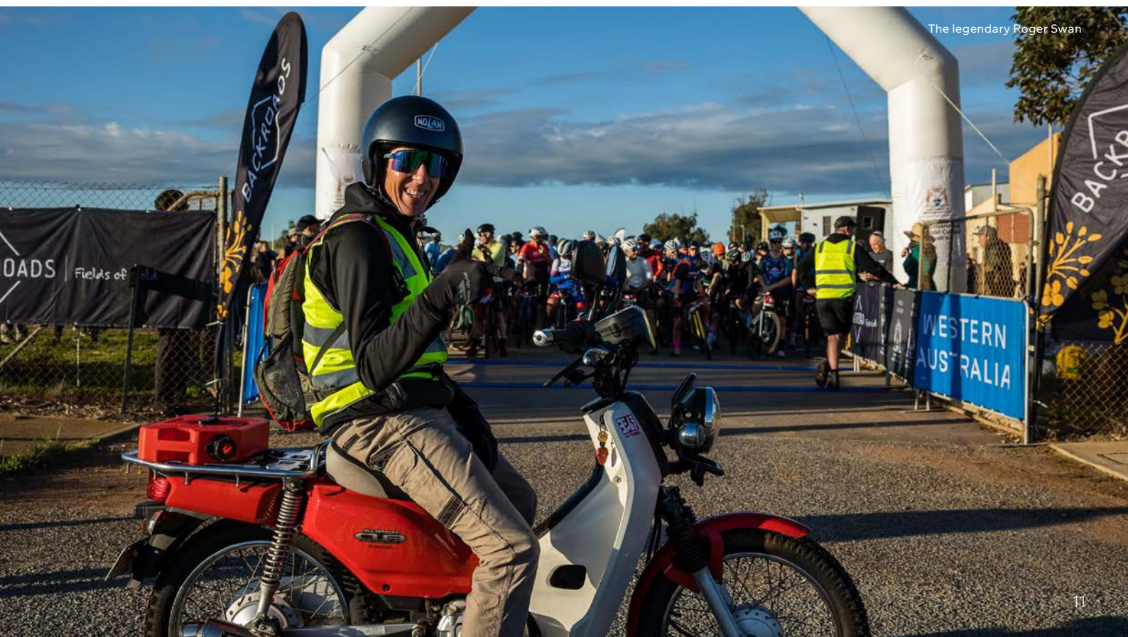
The legendary Roger Swan