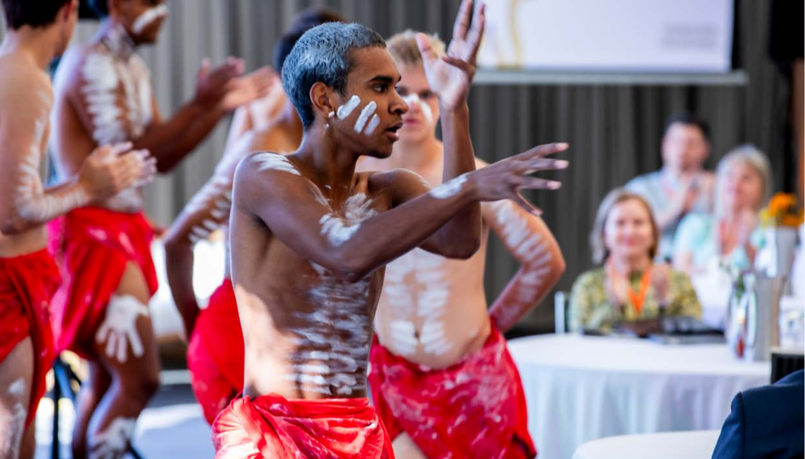
The Moorditj Mob, Wesley College