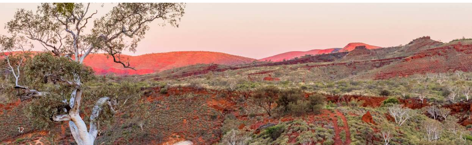
One of WA's prime tourism sites doesn't have a bank

“The repercussions for communities are profound, with limited access to basic financial services hindering day-to-day life, impeding access to financial information, affordable financial products like insurance, and contributing to poor financial literacy. The ripple effects extend to businesses, families, community organisations, and overall community well-being.”