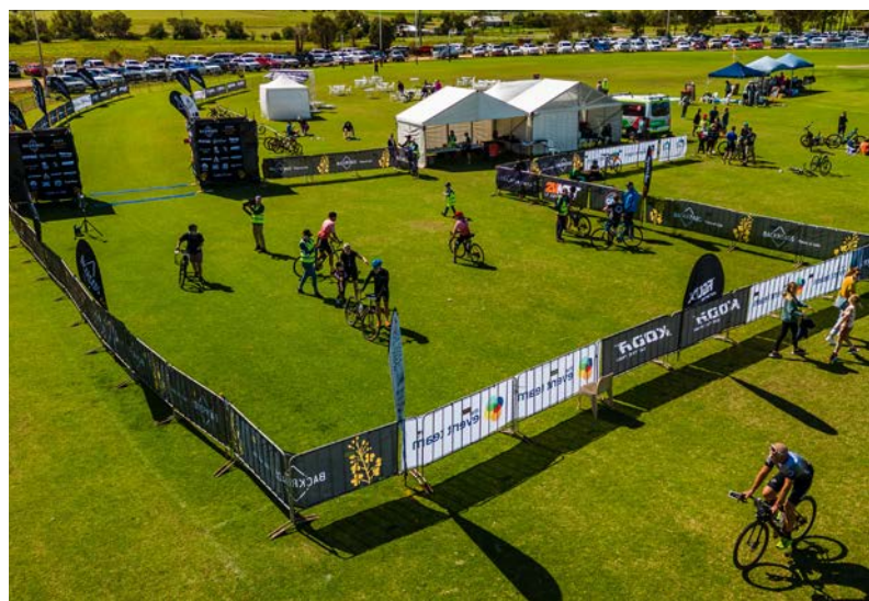
The Nabawa vibe