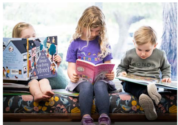
Libraries provide a social setting and a place to support literacy in children

"Quality libraries are a hallmark of a civilised society... it really is core and that's why it should be treated with sure core funding as a priority."