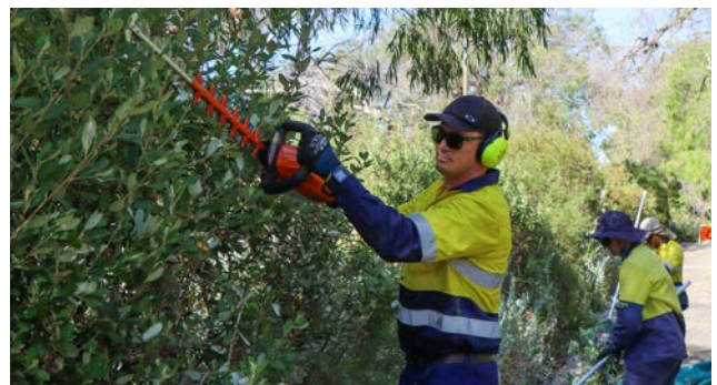
... and the tools

"The first is how important it is that organisationally we all filter information through to customer service so that they can continue to deliver a great service, with accurate and