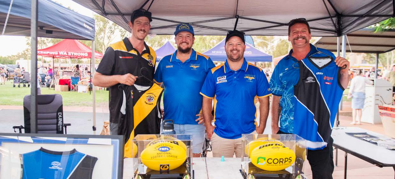
Community groups and clubs like the Tom Price Tigers and Townsite Eagles need a bank