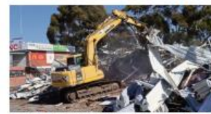
The football building that was built in 1955 was reduced to rubble in the matter of a few hours – paving the way for construction.

ity aciv in local facility needs of ing regio Follow improv