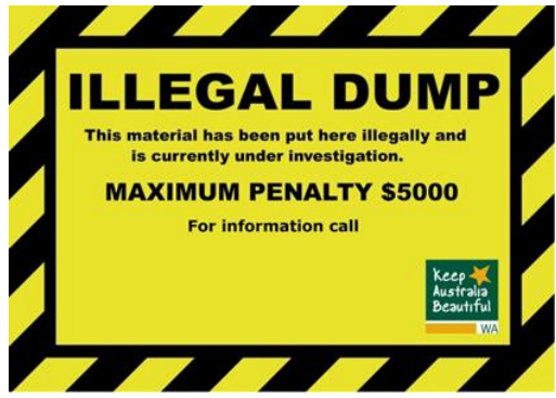
Figure 3: Example of material used to notify residents of other disposal options (City of Stirling).

If you see it, report it by calling (08) 9<u>205 8555</u>