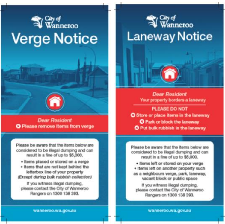
Figure 2: Example of material used to notify residents (City of Wanneroo).

Refer to Figure 2-4 for examples of the materials used to notify residents that illegal dumping has occurred.