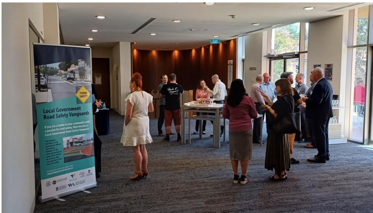
Participants at the November 2023 Vanguards Program