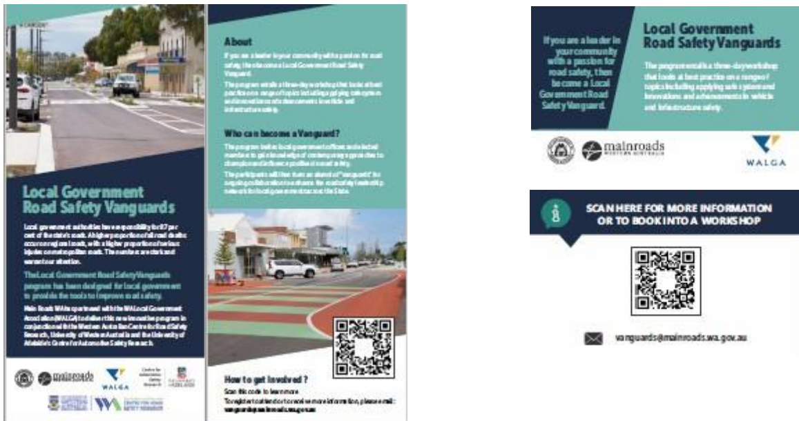
Leaflet and Business Card