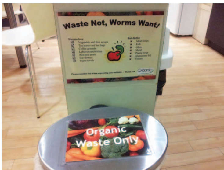
Figure 13: Clearly labelled dedicated food waste bin in office lunch room.

Bokashi bins – Bokashi is a method that uses an air-tight container and a mix of microorganisms to ferment food and minimise odour. Most practitioners utilize commercial microorganism starters comprising of a carbon base (e.g. sawdust or bran) impregnated with bacteria as well as a sugar for food (e.g. molasses). The mixture is layered with waste in a sealed container, where it does not decompose but ferments and reduces in volume as the water content of the waste drains through the grate at the bottom of the bucket. After a few weeks, removed and buried beneath the soil as a soil improver or added to a conventional composting system or worm farm.