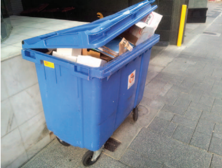
Figure 11: Dedicated 660L MGB for cardboard recycling presented for collection.