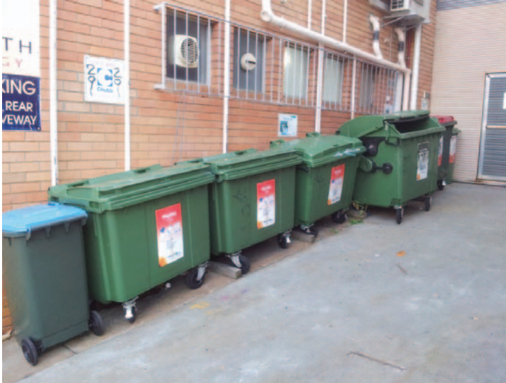
Figure 7: Inappropriate and unsafe storage of plastics recycling bins along a steeply inclined loading bay.