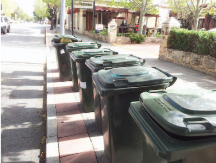
Figure 6: 240L MGBs for general waste presented for collection.

All collections should take place in accordance with all relevant legislation. If the storage area and presentation point are in separate locations, bins will have to be moved by staff or cleaners/ caretakers from the storage area to the collection point. In order to protect the occupational health and safety of employees: