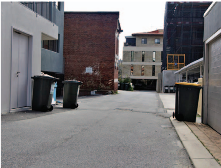
Figure 2: Haphazard storage of commercial bins within a rear laneway.

How the bin storage will be serviced is an essential consideration. Bins may be taken and emptied directly from the bin store area, or transported to a separate presentation point where they will be emptied by the service provider. If the storage is located away from the collection point, a responsible individual will be needed to transport separated waste from individual tenancies or areas.