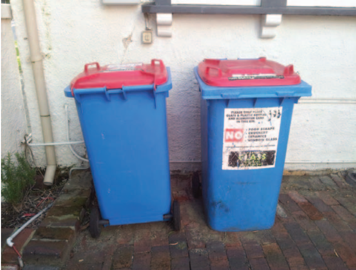
Figure 10: Commercial comingled recycling bins employed by a cafe.