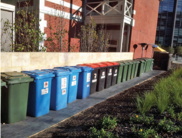
Figure 4: These bins are easily accessible, but highly visible from the roadway. A bin store would help to minimise their impact on local amenity.

It is essential to provide an adequate area to enable waste and recycling (and organics collected) bins to be kept separate within the storage area (Figure 5). However, bin storage areas that are too large may encourage bulky items to be dumped. The storage area should be designed for easy access and manoeuvring of bins to allow trouble-free cleaning. It is also important to consider the access requirements for maintenance and servicing. Other services and appliances, such as electrical meter boards, gas meters or conduits, should not be located in bin storage areas as they may be damaged during collection or cleaning.