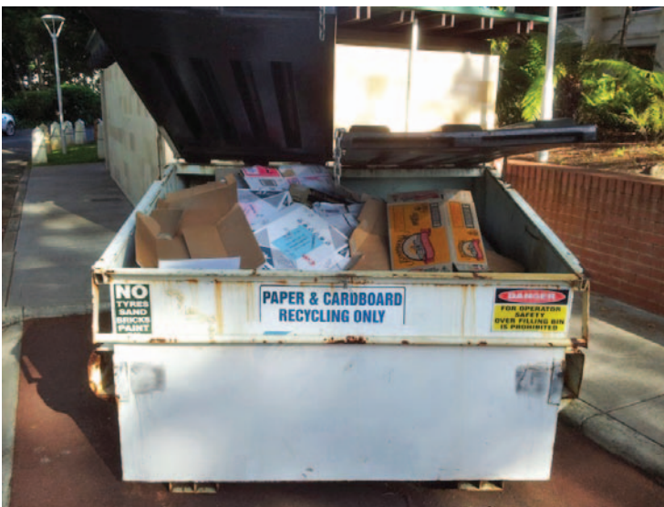
Figure 12: Commercial service providing a skip bin for the collection of large volumes of cardboard packaging.