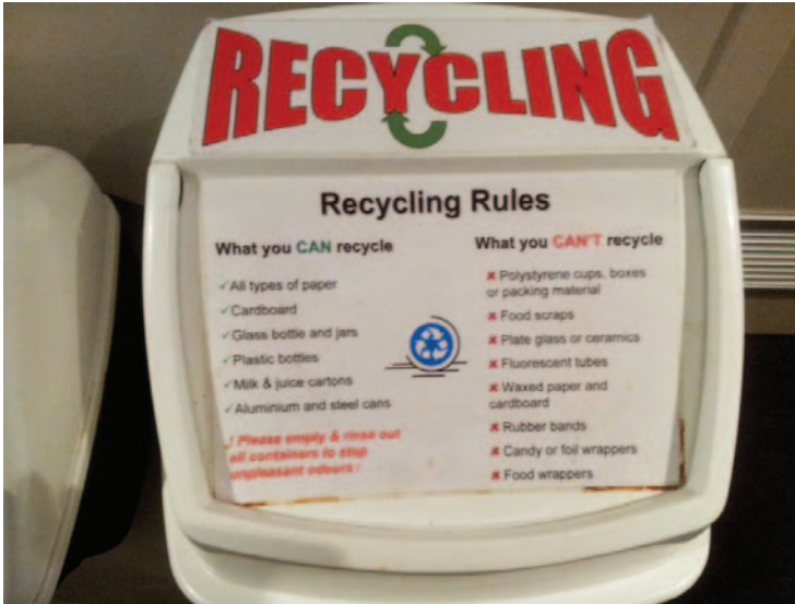
Figure 8: Comingled recycling collection bin outside office kitchenette.