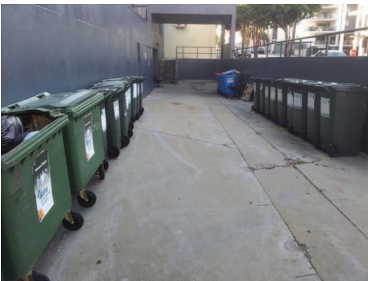
Figure 5: Appropriate storage of bins.

It is essential to provide an adequate area to enable waste and recycling (and organics collected) bins to be kept separate within the storage area (Figure 5). However, bin storage areas that are too large may encourage bulky items to be dumped. The storage area should be designed for easy access and manoeuvring of bins to allow trouble-free cleaning. It is also important to consider the access requirements for maintenance and servicing. Other services and appliances, such as electrical meter boards, gas meters or conduits, should not be located in bin storage areas as they may be damaged during collection or cleaning.