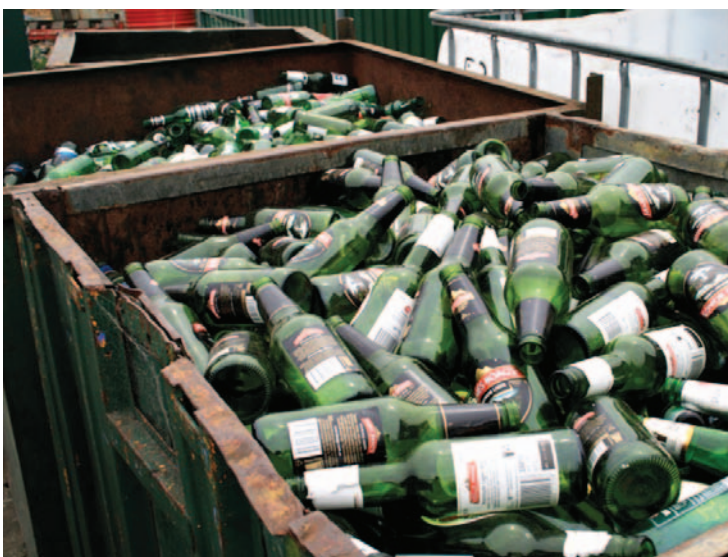
Figure 9: Large quantities of glass bottles are generated by pubs and clubs.

There is often limited space available back-of-house to store glass containers. In the past, bottles had to be kept whole so they could be separated into different colours for recycling, which increased the storage space required. However, the introduction of optical sorting equipment at recovery facilities means that systems that crush glass on site are now increasingly popular. However, if there is sufficient space; it may still be more viable to store whole bottles in bins (Figure 9). The emptying of dedicated glass bins can result in significant noise issues, so consideration must be given swapping rather than emptying bins and to the timing of collections to ensure compliance with the requirements of the Western Australian Environmental Protection (Noise) Regulations, 1997 .