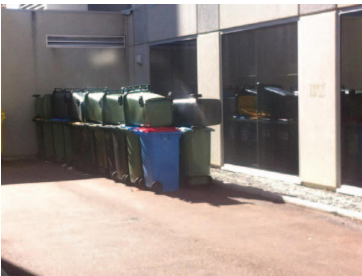
Figure 3: Inappropriate and unsafe storage MGBs.