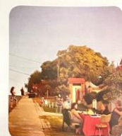
Bayswater driveway dinners