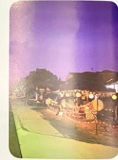
Driveway dinners Hamilton Street

Due to the change in restrictions in WA, the last event was on 18 May and neighbours were allowed to invite a few friends to participate as well.