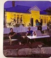
Local residents enjoying the free pizza from Rossoneo's