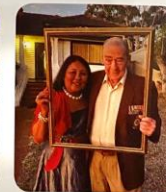
Local Bayswater residents